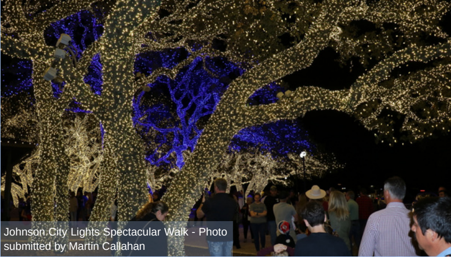
Johnson City Lights Spectacular Walk