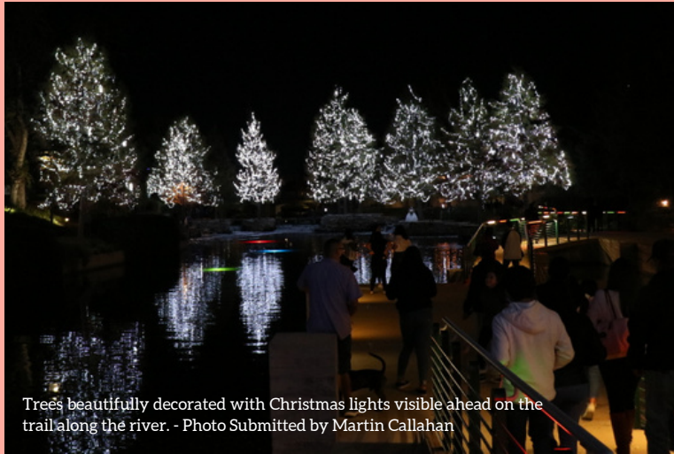
Trees beautifully decorated with Christmas lights visible ahead on the trail along the river.