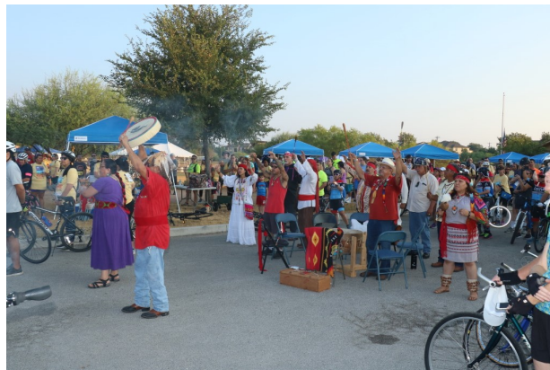
Native Americans help kick off the events with their traditional ceremony.

Please refer to the new AVA Heat Related Illness Prevention Guidelines on the AVA website: Click here for Guidelines.