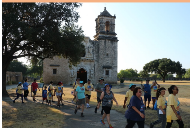
Volkssporters stroll along the trail past the front of Mission San Jose.